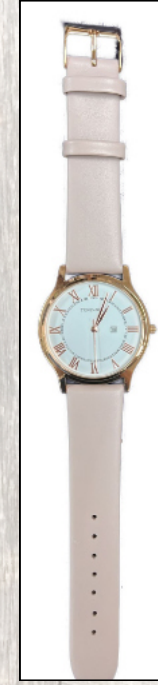
TWT011C Rose Gold/Light Pink