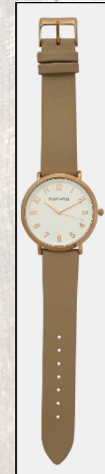
TWT008K Rose Gold/Beige