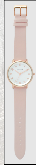
TWT008E Rose Gold/Light Pink