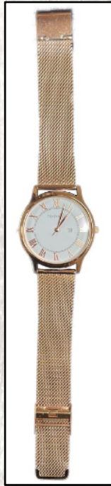
TWM011C Rose Gold