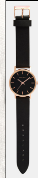
TWT004H Rose Gold/Black